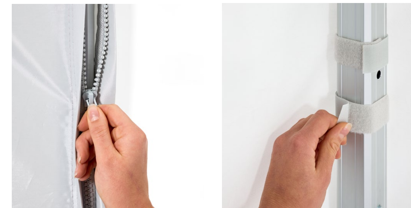
Zipper with PVC reinforcement at the bottom edge